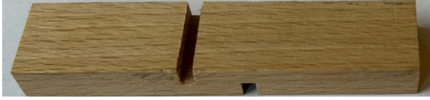
Figure 1a. Standard lap joint specimen (Beech, Adhesive surface l \times w = 10 \times 20 mm, width w adapted per series to the required load level)