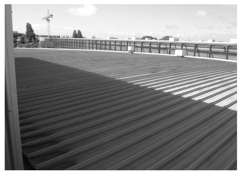
Figure 6: An example of light-weight flat roof where already the detailing only (elevated trough roof sheeting under sufficient slope in combination with lower positioned roof gutters) prevents any form of rainwater ponding that could impair the structural safety and quality of the roof

It is also clear, that for the roofs in category C and D, that do not comply with the code requirements, calculations have to be made to determine the measures that are necessary to take for improving these roofs. For such calculations, detailed data of the roof structure have to be available, such as steel sections used, steel grade used, etc. This is however not always the case, or is unproportionally difficult to obtain.