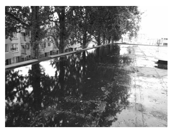
Figure 2: Rainwater ponding, no emergency overflow in the roof up stands