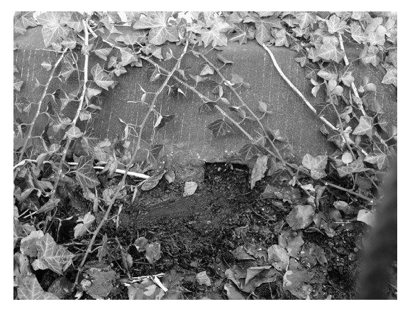
Figure 3: Plant growth and fallen leafs on the roof