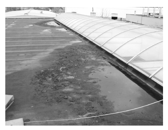
Figure 4: Light street blocking the roof slope results in ponding